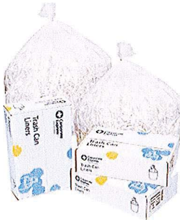
Staples supplied liners