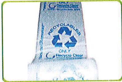
Vendor supplied liners

Plastic liners cost approximately $0.50 more each with volume discounts when ordered from Recycle Clear and ClearStream. These vendor supplied plastic liners have the word "recycle" printed on their recycling liners. The thickness, mil rating, star seal on the bottom, cost and transparent or translucent material are key factors. Translucent plastic liners help remind people these containers are for recyclable items like cans and bottles and not trash. Translucent plastic recycling liners have a better chance of being accepted by a recycling factory.